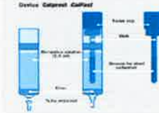
Figure 2: The Eurospital extraction device.

The sample extract is then transferred from the ES tubes by breaking the tip at the bottom of the tube and then squeezing the ES tube, squirting the supernatant into a suitable tube for FC ELISA analysis. Care has to be taken not to dislodge the pellet at the other end of the tube. The secondary tubes then require centrifuging again at 3000 rpm for 5 minutes, in case any faecal matter was transferred prior to FC analysis. Once extracted the extracted sample is stable at 2-8°C for 7 days and at -20°C for 24 months.